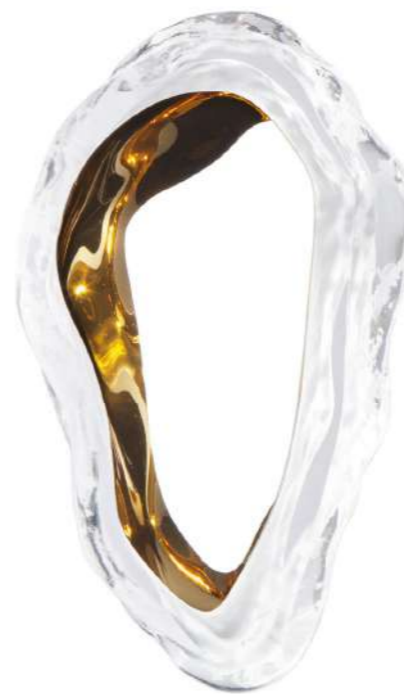
Crystal + Opal + Gold + French embossing