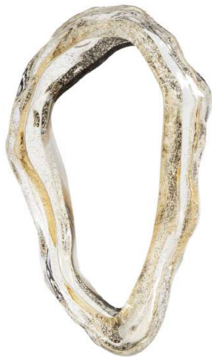
Crystal + Champagne + Soda

Width: 180 mm (7,09 in) Height: 280 mm (11,02 in) Depth: 68 mm (2,68 in) Weight: 2,8 Kg