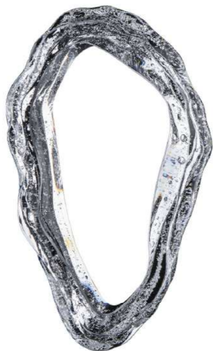
Crystal + Soda