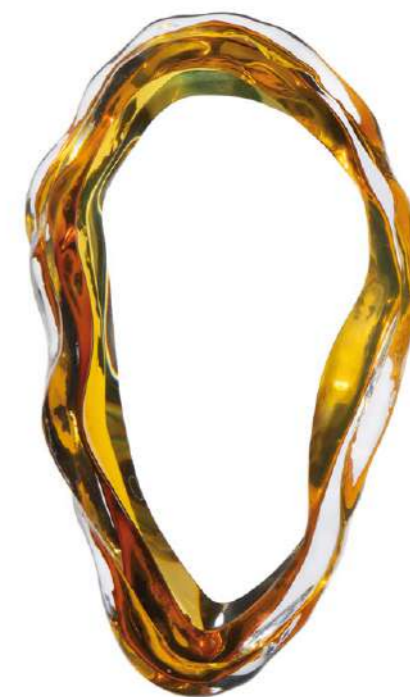
Crystal + Gold topaz